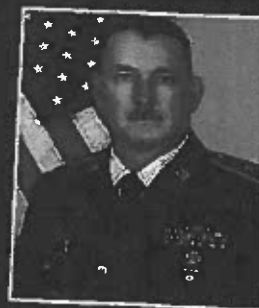
The Seiler Family